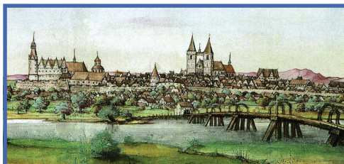
Wittenberg in 1536

Martin Luther was born in 1483 in what is now central Germany but then was a separate principality called Saxony. His parents tried to give him a good education and hoped he would become a lawyer. Instead, when he was twenty-one he became a Catholic monk. He wanted to earn God's love but was tormented by the sense that he could never be good enough. He punished himself mercilessly until finally a wise mentor sent him to study and teach Bible at the then new University of Wittenberg.